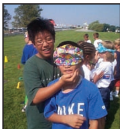
Citizenship Through Sports Alliance

Need one more reason to keep it fun? Young people report a variety of reasons for dropping out of sports, but one reason that stands out is this: “It just wasn’t fun anymore.”