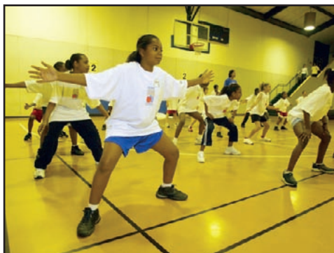
National Youth Sports Corp.