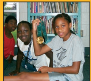
Citizenship Through Sports Alliance