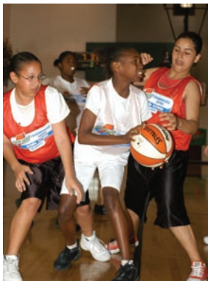
National Basketball Association

How can you keep your child active and benefiting from youth sports?