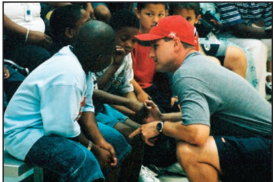
Citizenship Through Sports Alliance