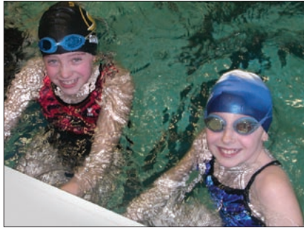
National Youth Sports Corp.