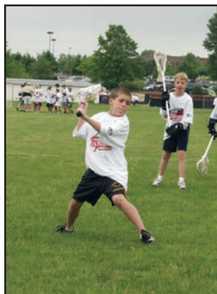
National Youth Sports Corp.

Sports specialization – playing one sport exclusively or year round – is a relatively new phenomenon. Years ago, young athletes played baseball in the spring, football in the fall and basketball in the winter.