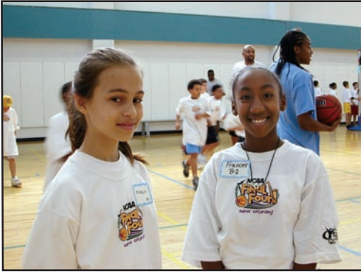
National Youth Sports Corp.

Sometimes it's appropriate to encourage your child to practice a skill or develop a new technique. Perhaps you'd like to give your child a bit of constructive criticism without discouraging him. How can you do that?