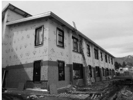
Top Left: Classroom Entrance Area B