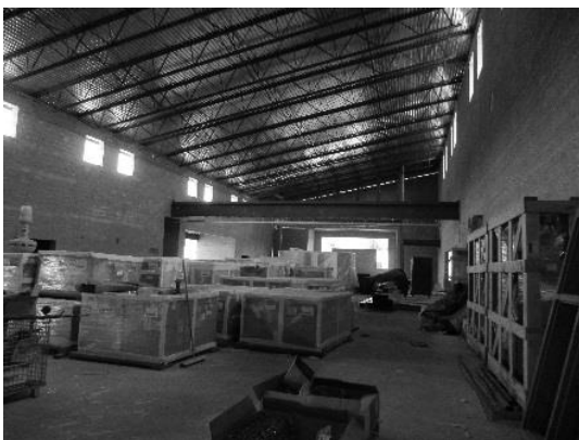
Bottom Right: Mechanical Floor